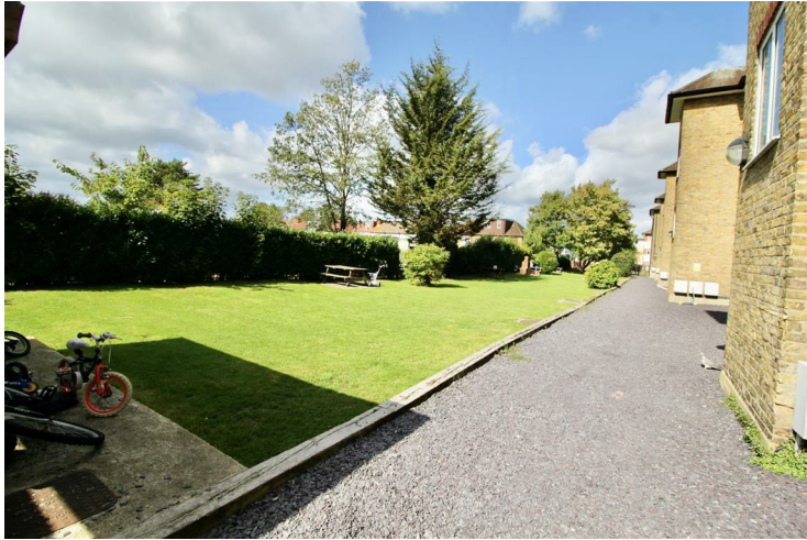
Communal rear gardens